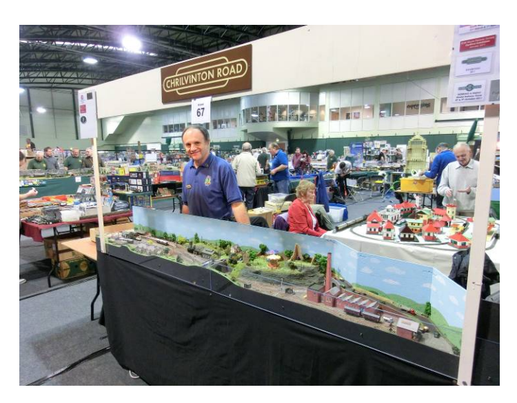
Overall Layout at Shoeburyness Model Railway Show

Exhibition Information is attached and is in 4 sizes depending on your space available so please feel free to use as required. The word count for the text is 70, 140, 250 and 550 words.