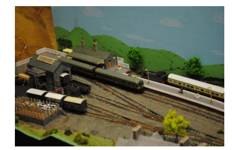
Local DMU waits